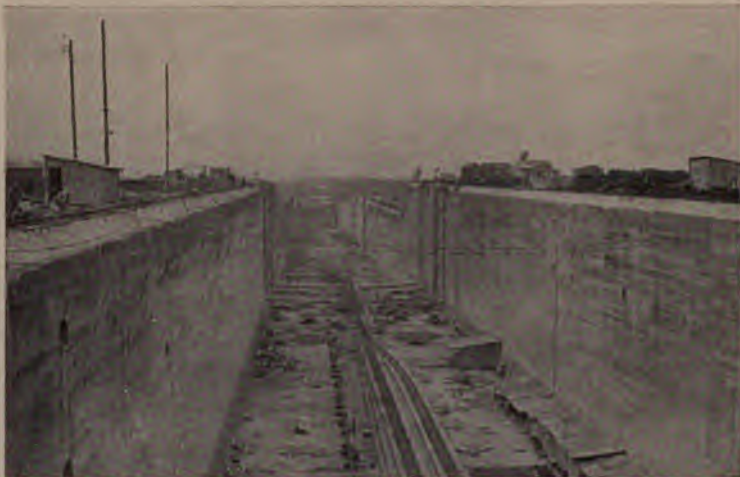
"Far below were tiny men and toy trains"